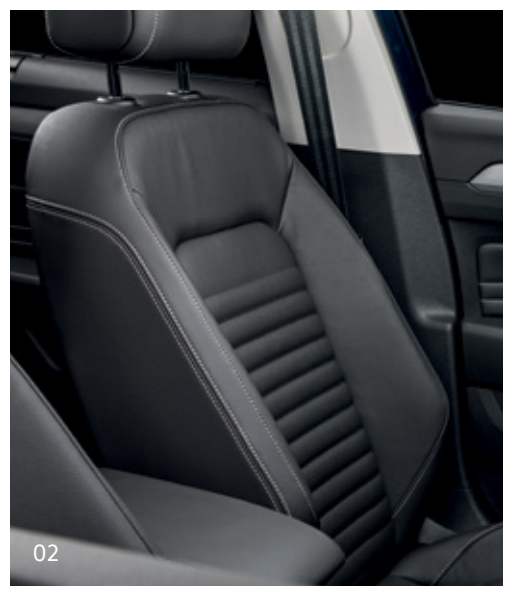
01 Air Care 3-zone climate control 02 Vienna leather appointed<sup>#</sup> seat upholstery