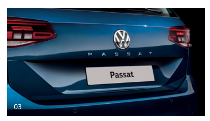
01 Discover Pro 8" screen with Wireless Apple CarPlay® 02 Discover Pro 8" screen with Gesture Control 03 Rear View Camera (RVC Plus)