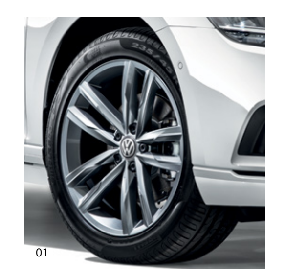
01 Dartford 18" alloy wheel in Anthracite

With its understated aesthetics, flowing lines and comprehensive practicality, there's no doubt the Passat has been designed to impress.