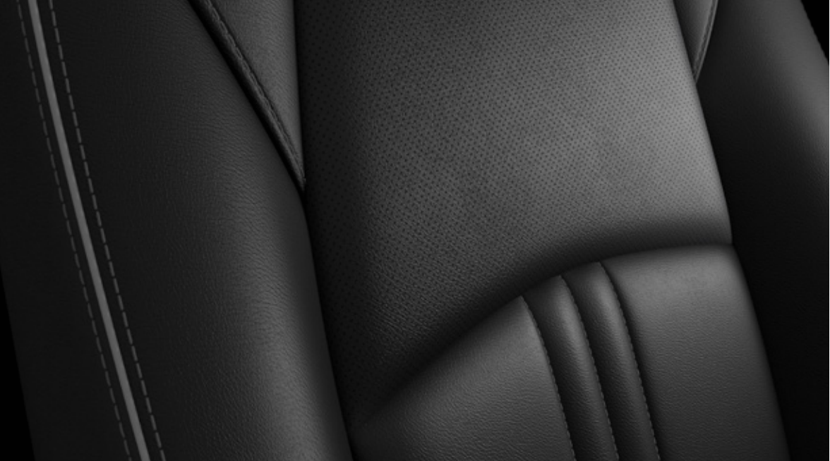
Black leather# (G20 Akari)