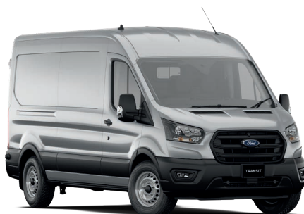
Moondust Silver 1