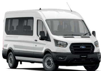
Transit 410L RWD Bus