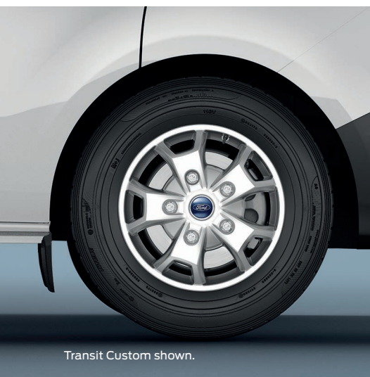
Transit Custom shown.