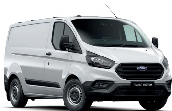
Transit Custom 340S SWB Van