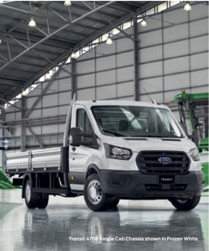
Transit 470E Single Cab Chassis shown in Frozen White