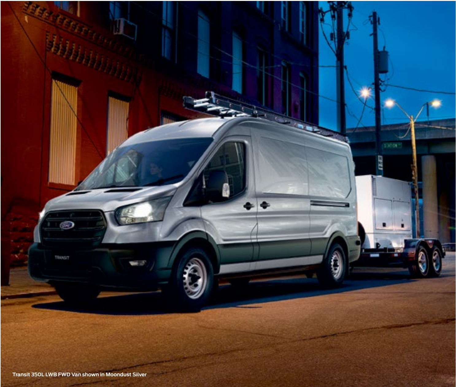
Transit 350L LWB FWD Van shown in Moondust Silver