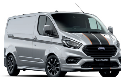
Moondust Silver 1