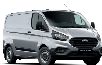
Moondust Silver 1