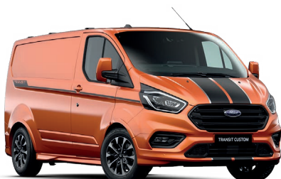
Orange Glow 1