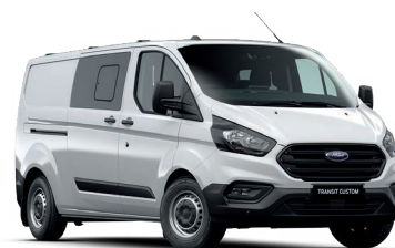
Transit Custom 340L DCiV Van