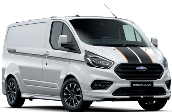
Transit Custom Sport 320S Van