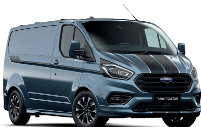
Blue Metallic 1