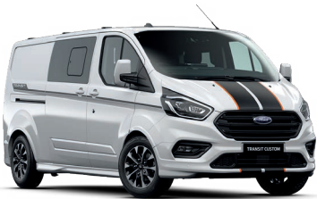
Transit Custom Sport 320L DCiV Van