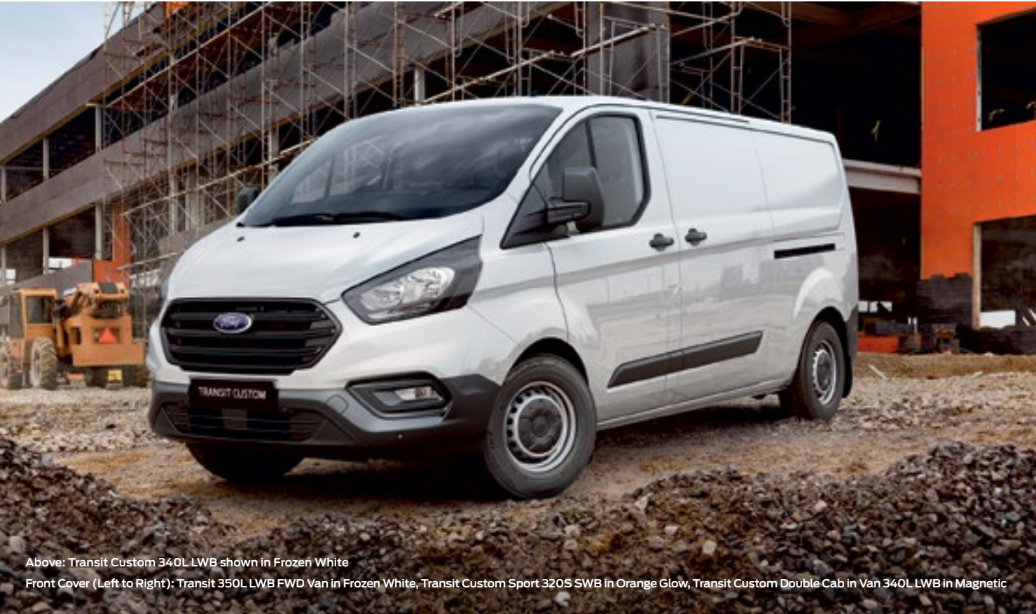
Above: Transit Custom 340L LWB shown in Frozen White Front Cover (Left to Right): Transit 350L LWB FWD Van in Frozen White, Transit Custom Sport 320S SWB in Orange Glow, Transit Custom Double Cab in Van 340L LWB in Magnetic