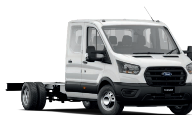
Transit 470E RWD Double Cab Chassis