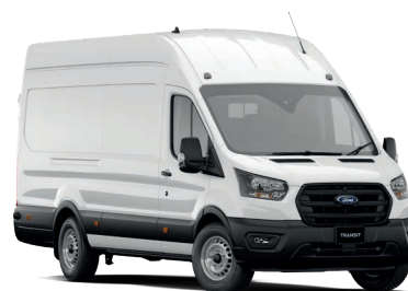
Transit 350E RWD Jumbo Van