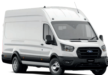
Transit 470E RWD Jumbo Van