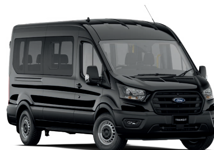
Agate Black 2