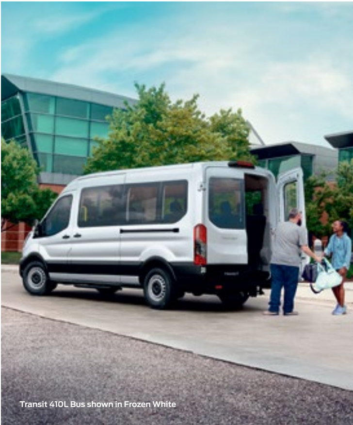
Transit 410L Bus shown in Frozen White