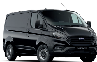
Agate Black Metallic 1