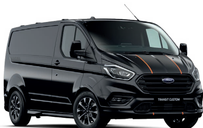
Agate Black Metallic 1