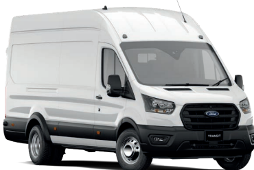
Transit 430E RWD Jumbo Van