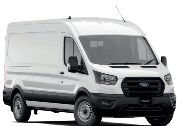
Transit 350L LWB RWD Van