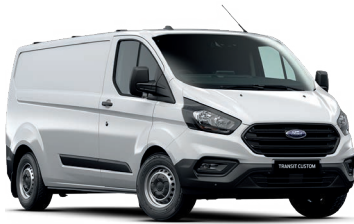
Transit Custom 340L LWB Van