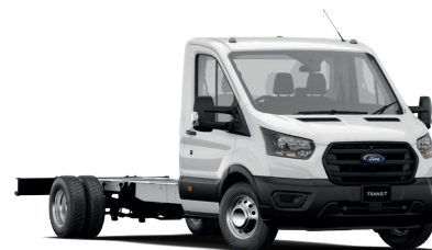
Transit 430E RWD Single Cab Chassis