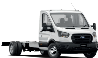
Transit 470E RWD Single Cab Chassis