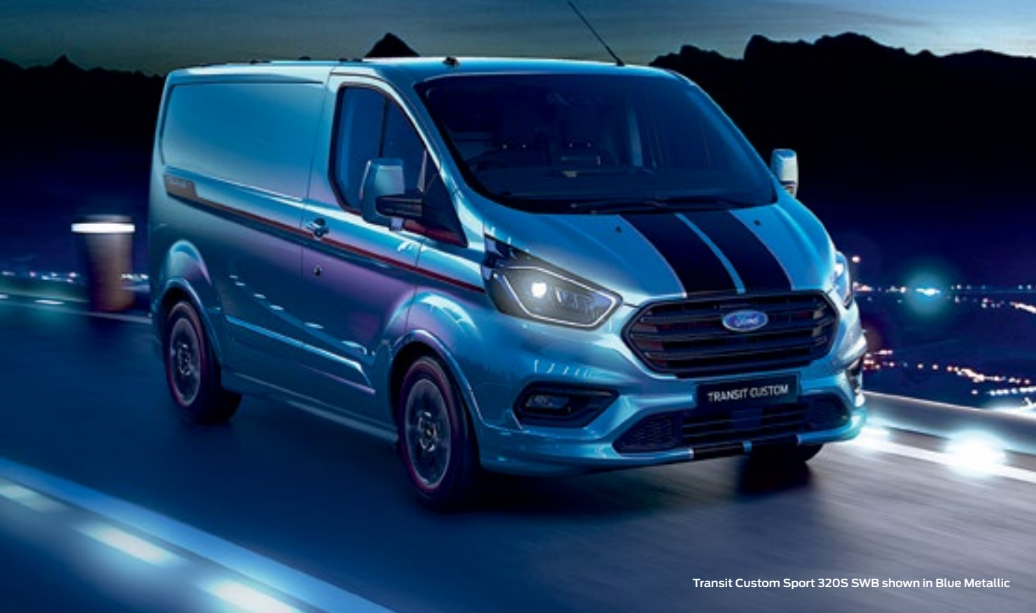
Transit Custom Sport 320S SWB shown in Blue Metallic

Welcome to the award-winning Ford Transit Commercial Range. Renowned for capability, dependability, safety, efficiency and car-like drive and comfort, the comprehensive Transit line-up is built to get the job done.