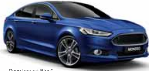
Deep Impact Blue*