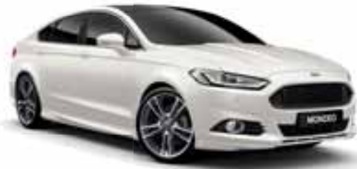
White Platinum Tri Coat*