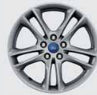
17" x 7.5" alloy wheel Hatch & Wagon