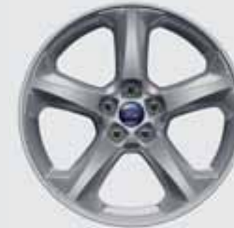
18" x 8.0" alloy wheel Hatch & Wagon