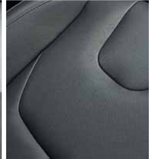
Seat Insert: Salerno Leather Charcoal Black Seat Bolster: Salerno Leather Charcoal Black