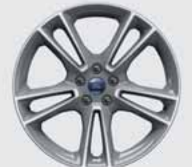
19" x 8.0" alloy wheel Hatch & Wagon