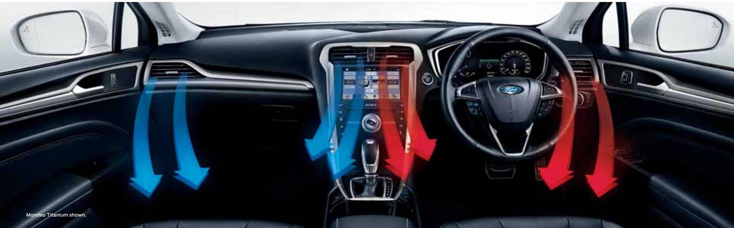
Mondeo Titanium shown.