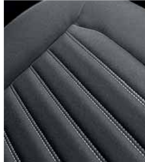
Seat insert: Cloth Ebony Seat bolster: Cloth Ebony