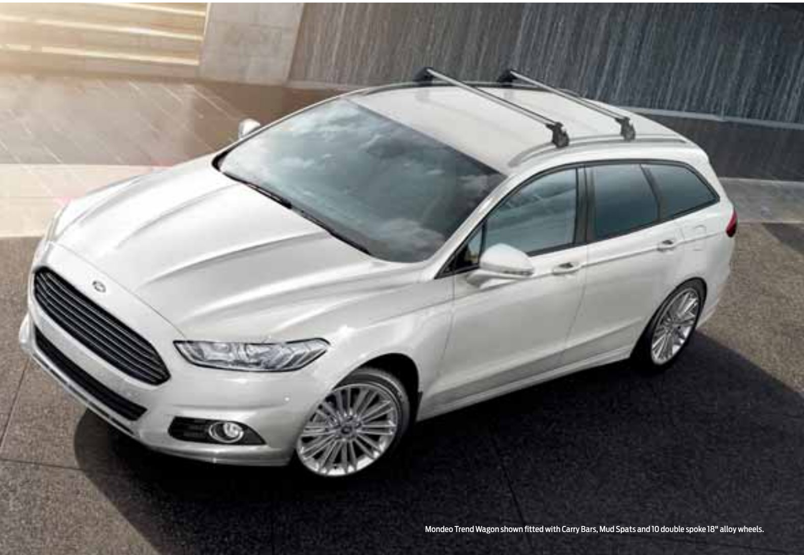
Mondeo Trend Wagon shown fitted with Carry Bars, Mud Spats and 10 double spoke 18" alloy wheels.

Like the hem of a perfectly tailored suit, your choice of vehicle accessories are the final details that make sure your Mondeo has everything it needs to suit you and your lifestyle.