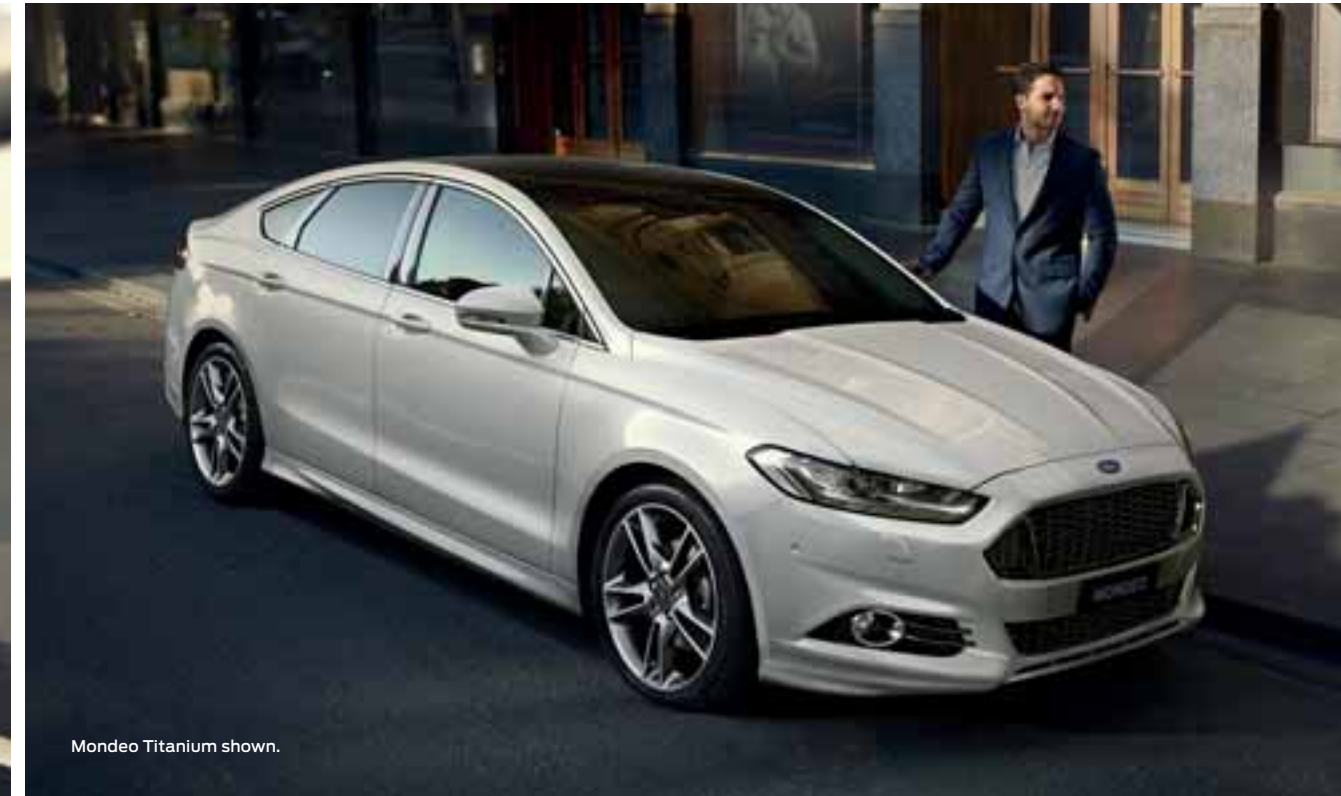
Mondeo Titanium shown.

Wherever you look inside the Mondeo's cabin, you'll find a perfect blend of form and function. Sleek, elegant interiors house the Mondeo's intuitive features, while the ergonomic styling makes sure they're always within reach.