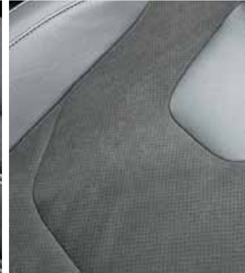
Seat Insert: Perforated Miko Charcoal Black Seat Bolster: Salerno Leather Charcoal Black