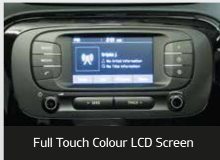
Full Touch Colour LCD Screen