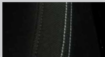
Black Cloth Seats with Light Grey Stitch