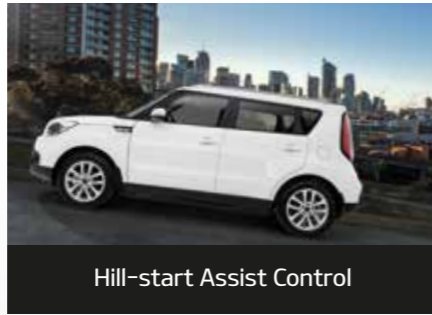
Hill-start Assist Control