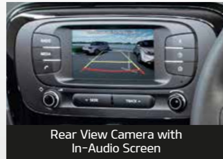
Rear View Camera with In-Audio Screen