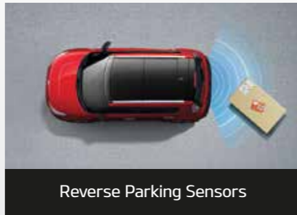
Reverse Parking Sensors