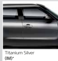
Titanium Silver (IM)*