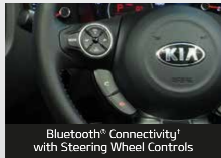
Bluetooth® Connectivity* with Steering Wheel Controls