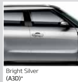
Bright Silver (A3D)*