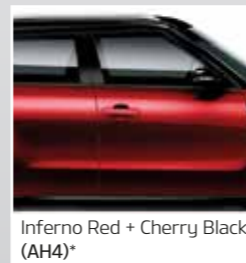
Inferno Red + Cherry Black (AH4)*

*Two tone paint and premium paint at additional cost