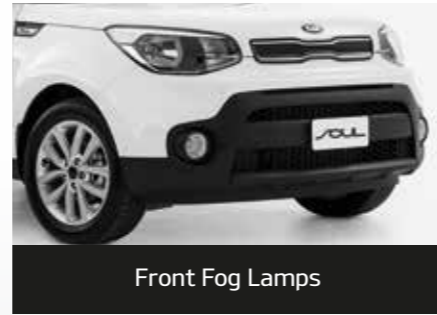
Front Fog Lamps