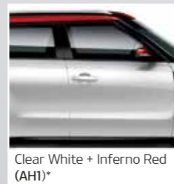
Clear White + Inferno Red (AH1)*