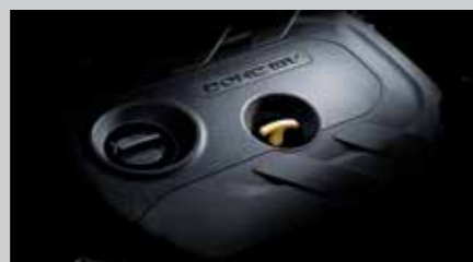
112kW 2.0L Petrol Engine