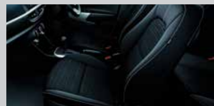
Cloth Trim Seats